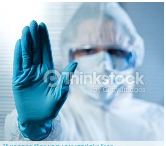
75 suspected Ebola cases were reported in Spain.

The EU response to the outbreak of Ebola virus disease illustrated how EU countries, including Spain, worked together through an acute crisis. The European Commission's Health & Food Safety Directorate-General has monitored Ebola, in cooperation with the European Centre for Disease Prevention and Control (ECDC) and the World Health Organisation (WHO), since the outbreak began in West Africa in March 2014. The